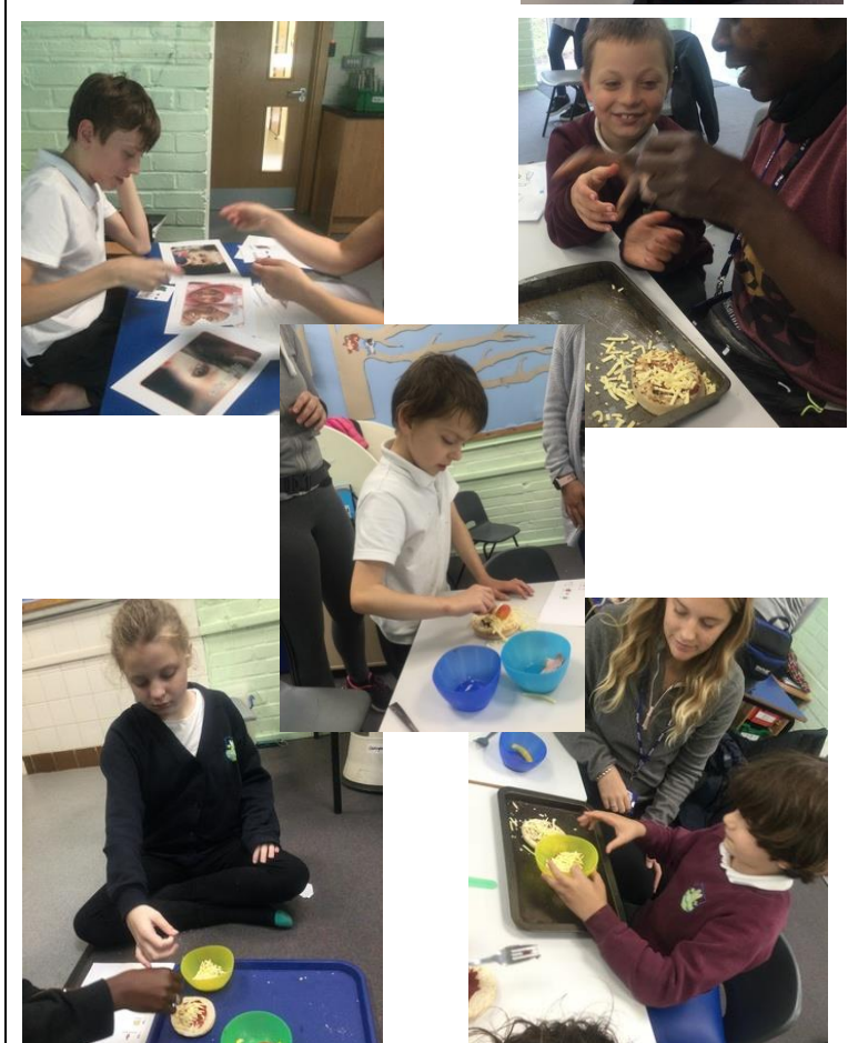
Dates & Points to remember:

21st October – Last day of term 31st October – First day of term