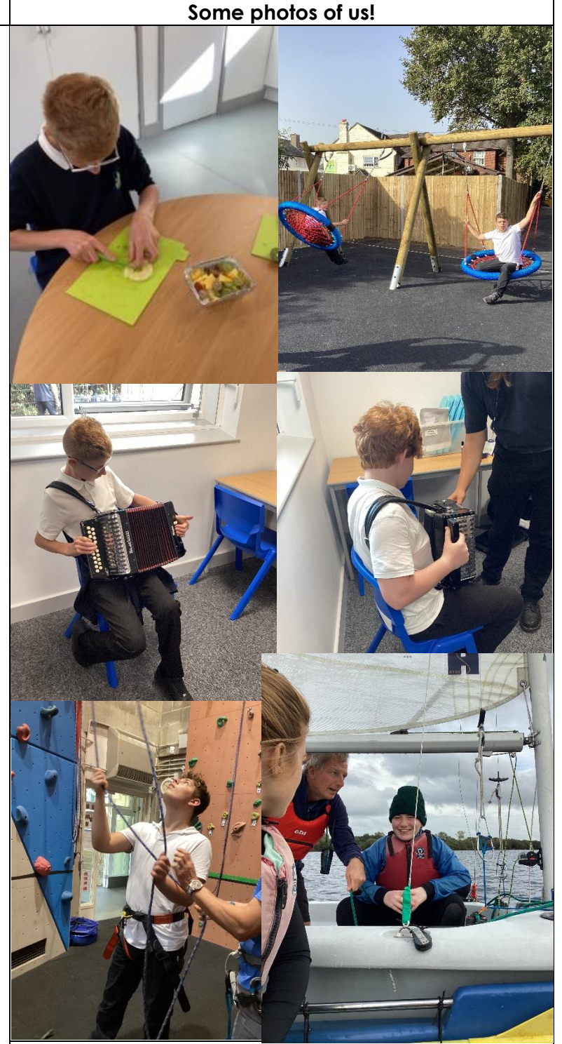
Dates & Points to remember:

Last day of term: Friday 16th December 2022 First day back: Wednesday 4th January 2023 Last day of term: Friday 10th February 2023