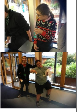
Dates & Points to remember:

Last day of term: Wednesday 20th December 2023 First day back: Tuesday 9th January 2024