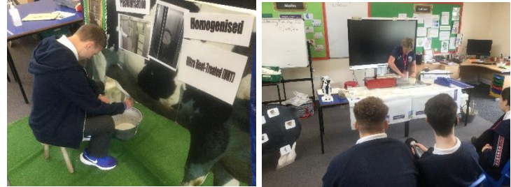
Visit from Agricultural Society.