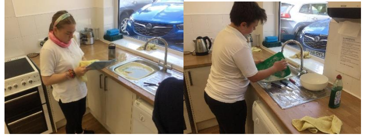
Practising home skills in the kitchen.