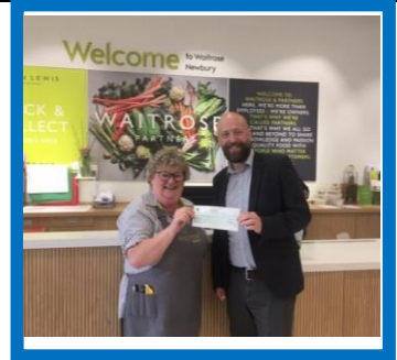
A kind donation from Waitrose Newbury