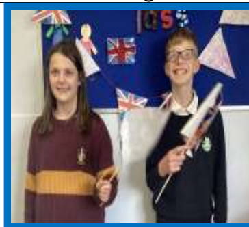
Coronation celebrations took place across the school